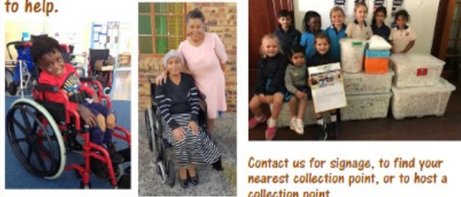
Contact us for signage, to find your nearest collection point, or to host a collection point.

M aussiebreadtags@gmail.com www www.breadtagsforwheelchairs.co.za 0418 807 072 f aussiebreadtags Local Contact: ..... breadtagsforwheelchairs