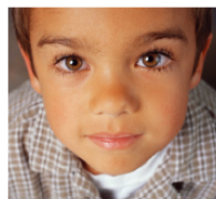
Updated July 2021

Venue: ac.care Conference Room 29 Bridge Street Murray Bridge