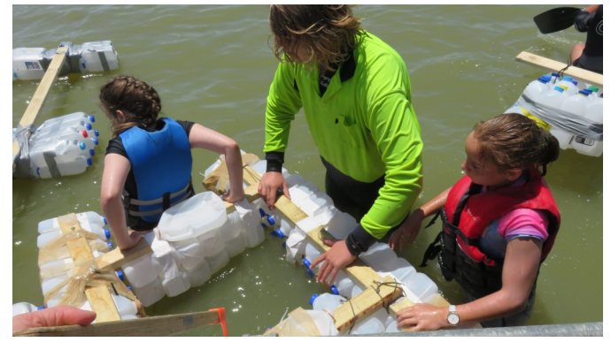
Bravery - Respect - Excellence - Mindfulness - Enthusiasm - Responsibility