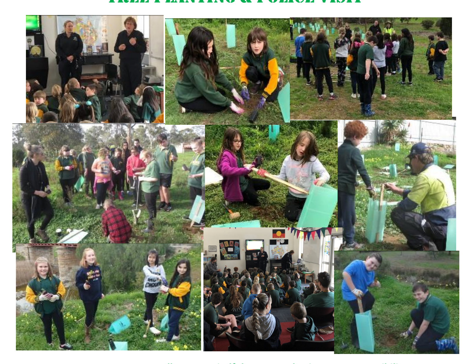
Bravery - Respect - Excellence - Mindfulness - Enthusiasm - Responsibility